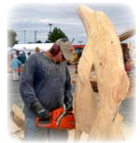
The Westwoods in Washington raised money at a chainsaw carving competition.