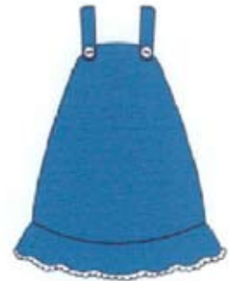
Girl's Jumper $20