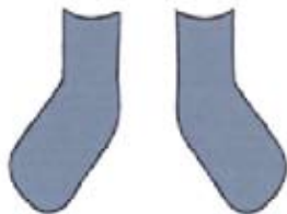
Boy's/Girl's Socks $5

Help with another item, Your choice $ _____