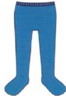
Girl's Jumper Pants $30