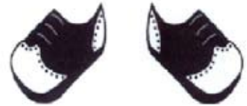
Boy's/Girl's Shoes $40