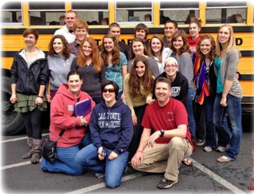
The youth group getting ready for their long drive from Ashland to Ensenada, March 22 nd earlier this year. What a blessing they are to us!