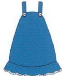
Girl's Jumper $20