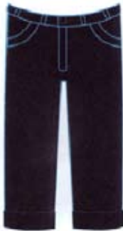
Boy's/Girl's Pants $35