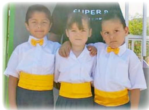
Our youngest "graduating class," the kindergarten graduates