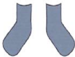
Boy's/Girl's Socks $5