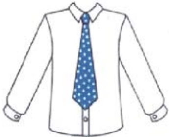
Boy's/Girl's Long-Sleeve Shirt/Sweater $25

Please help by choosing one of the items below and sending in a donation to help us purchase the pieces of the children's mandatory uniforms. ¡Gracias for your help!