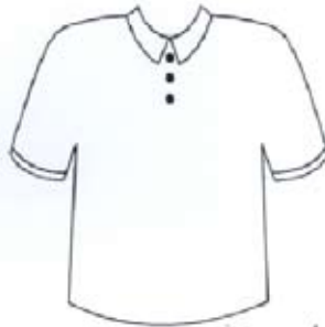
Boy's/Girl's Short-Sleeve Shirt $10