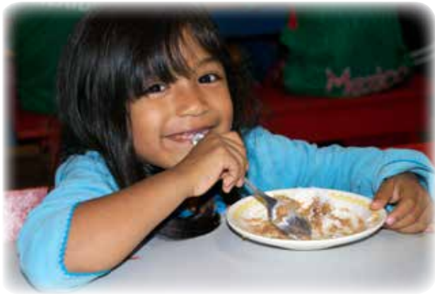
Our Compadres put food on our table.

Who are Our Compadres? They are committed individuals, families, churches, and companies who give from $5 to hundreds of dollars per month. Some give through the Child Sponsorship program ( see page 4 ), and others through matching programs at their work. They are from the U.S. and Canada, and young to old. While many of them have visited us at our home, there are quite a few who haven't.