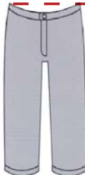
Sweatpants or Skirt $15