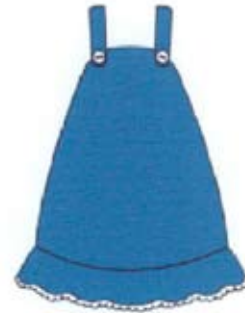
Girl's Jumper $20