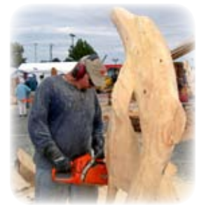
The Westwoods in Washington raised money at a chainsaw carving competition.