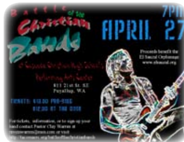
A youth group in Tacoma, WA held Battle of the Band competitions to generate support.