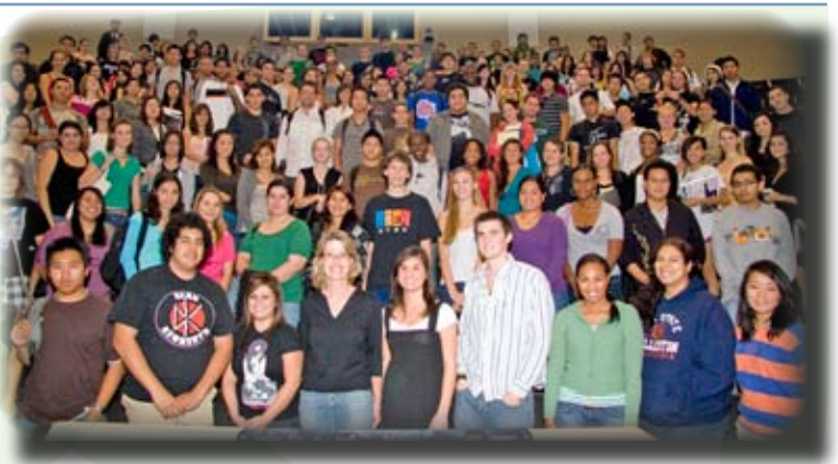
CSUF's American Government class gave their change to help El Sauzal

The professor passed an envelope around the class expecting to harvest the change out of her student's pockets and purses, but after the envelope found its way back to the front of the lecture hall,