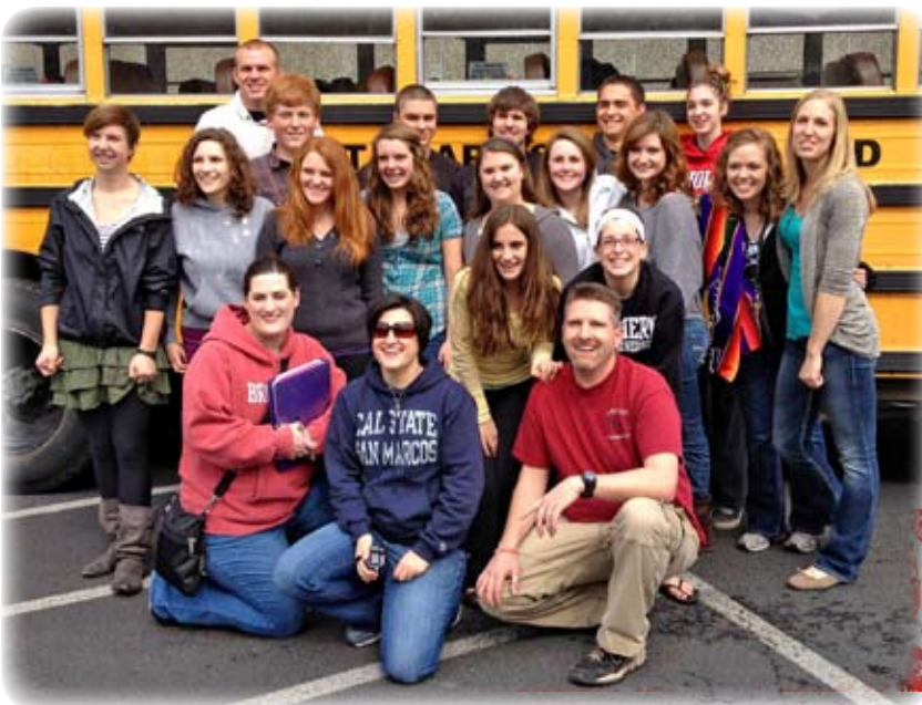
The youth group getting ready for their long drive from Ashland to Ensenada, March 22 nd earlier this year. What a blessing they are to us!