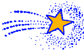
College Education for One of Our Teens $500 per Month